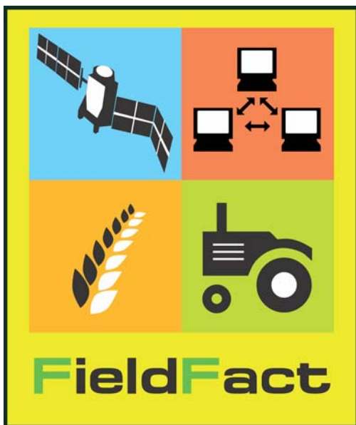
Figure 3. FieldFact icon logo.